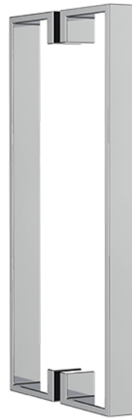
Double Door Handle